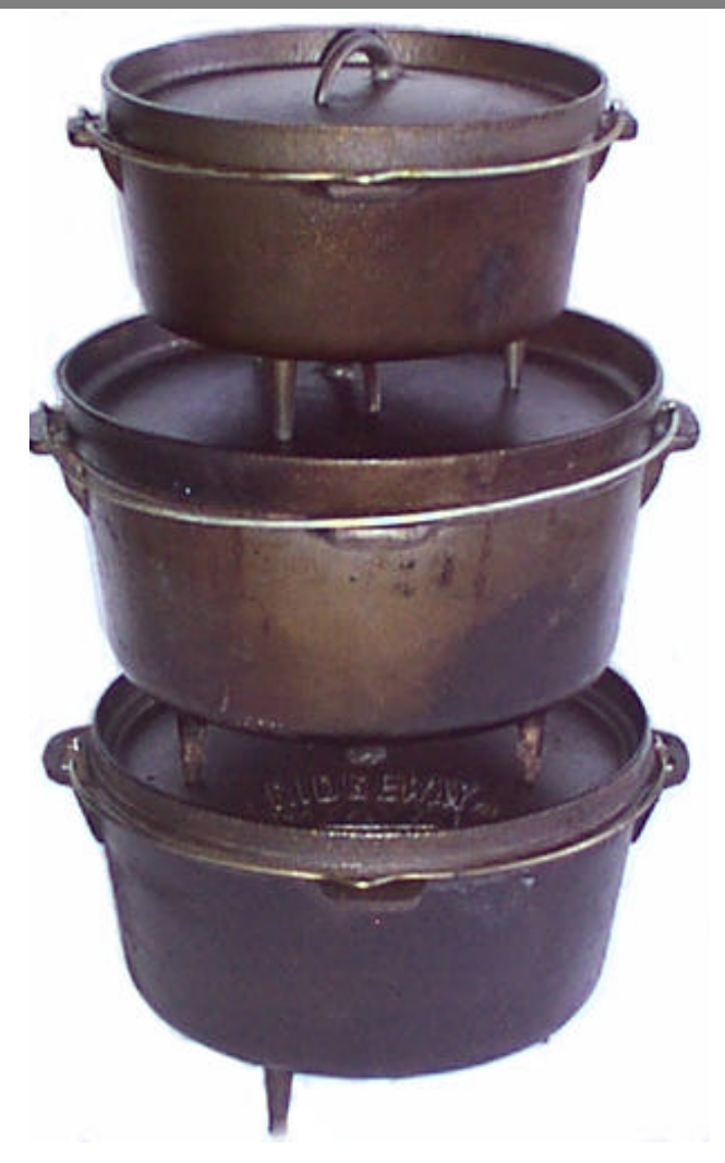
Revised January 2004