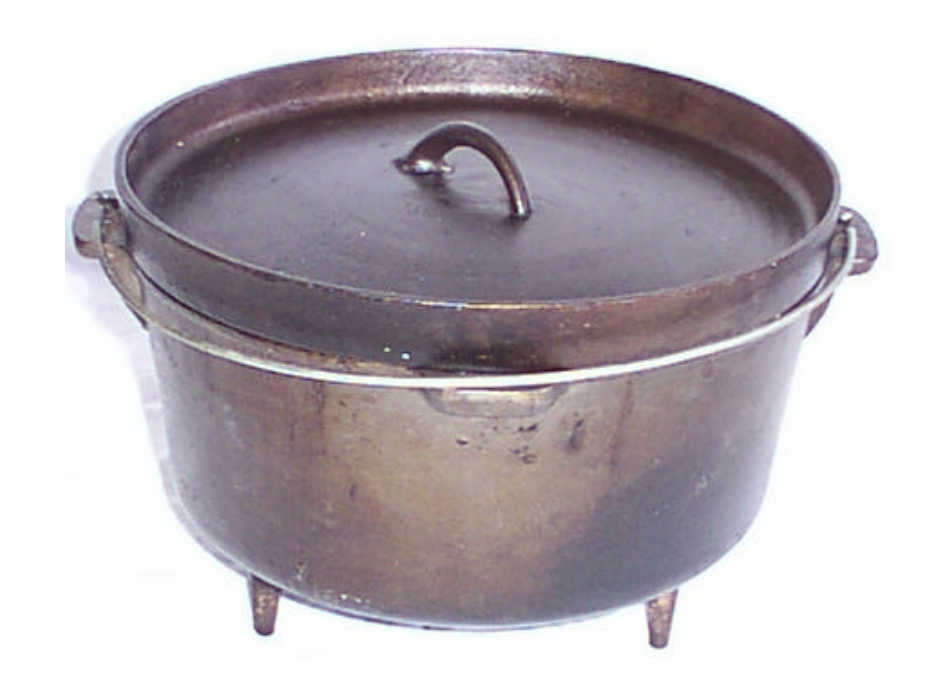
For free duplication within the World Brotherhood of Scouting